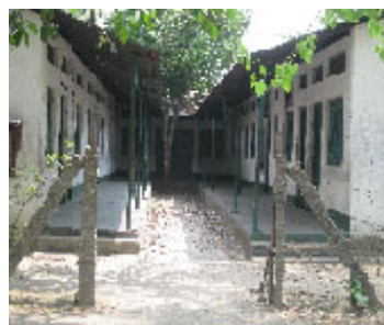
Beldangi CMC Office