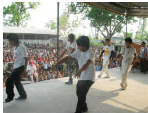
Performing dance in program.

Over one and half dozen dances and songs were performed by students and it entertained more than 5,000 audiences. Creative classes is running by MNB in financial